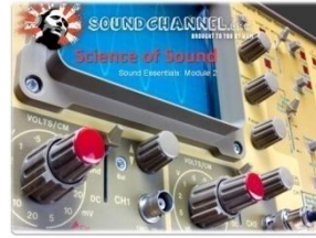
Science of Sound