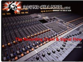
Recording Chain/Signal Flow