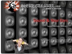
Sound & Your Ears